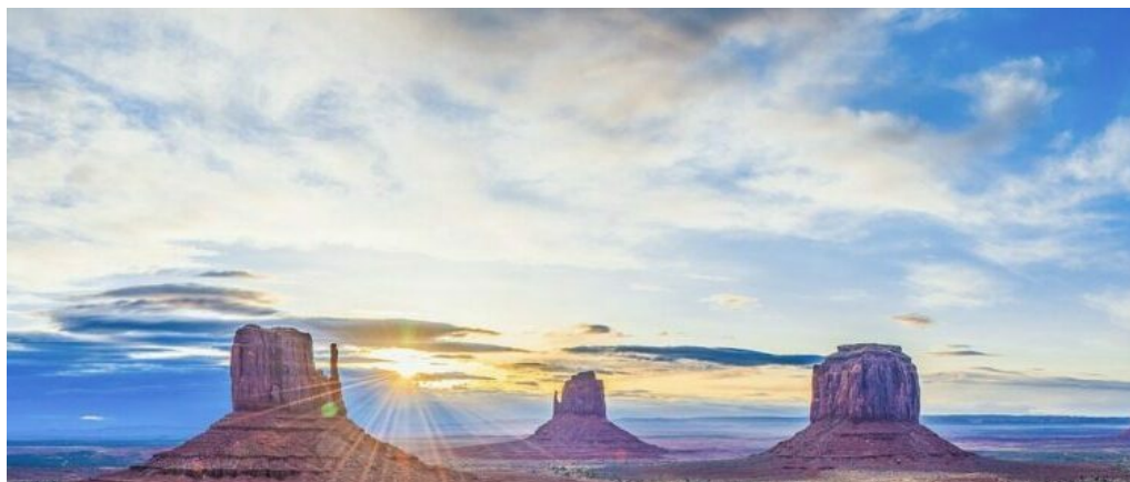
OLJATO-MONUMENT VALLEY, UTAH