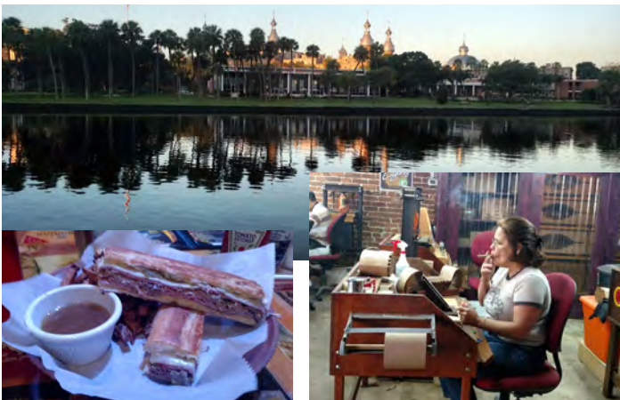
Some images of Tampa: beautiful surroundings, hardworking women and men, and great Cuban sandwiches!

On a side note, wanting to get a feel for Florida I spent an afternoon in Historic Ybor City and talked to a group of Cuban American cigar factory workers. The men and women I talked to immigrated to the U.S. at a high risk with hopes and dreams of being able to provide a better future for themselves and their families. Navigating in uncharted waters and at times dealing with ruthless individuals, these folks were willing to search for and establish a new home and fulfill the American Dream.