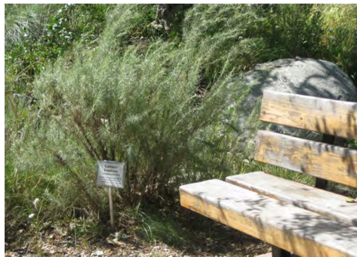
Bench and typical sign in the plant garden.